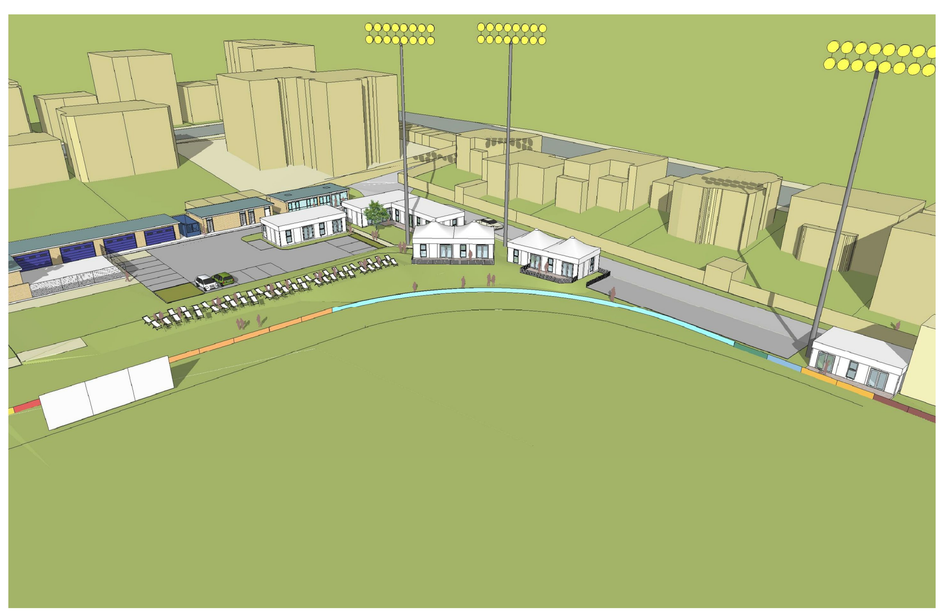
View of new units from Southwest