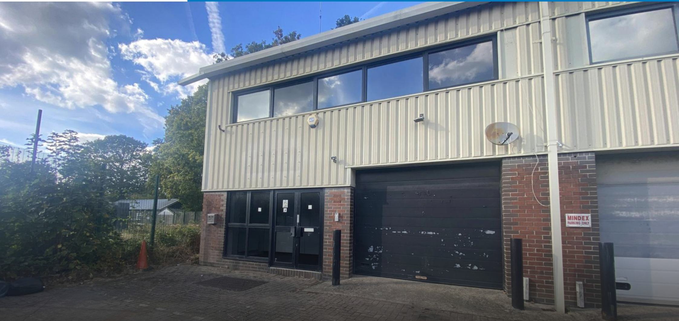
Unit 5 Gatwick Metro Centre, Horley, RH6 9GA TWO STOREY BUSINESS UNIT WITH PARKING